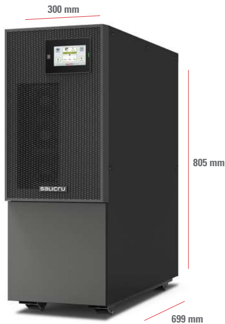
SLC 10000-20000 TWIN PRO3 MULTI SLC 10000-20000 TWIN PRO3 MULTI B1