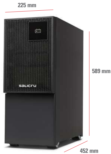
EBM - SLC TWIN PRO3 MULTI