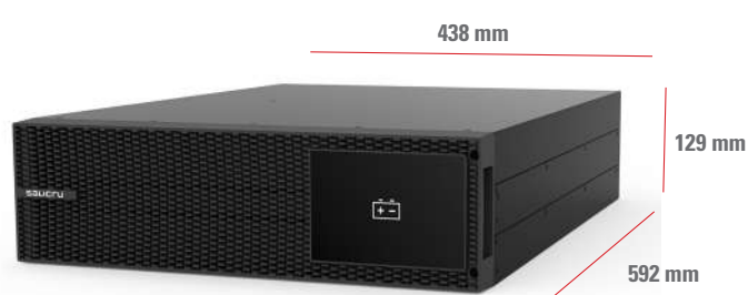
EBM - SLC TWIN RT3 MULTI