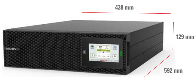
SLC 10000-20000 TWIN RT3 MULTI B0